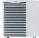
aroTHERM air source heat pump