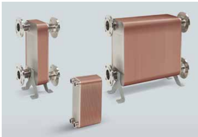
Low-loss plate heat exchangers