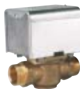
2 port valve