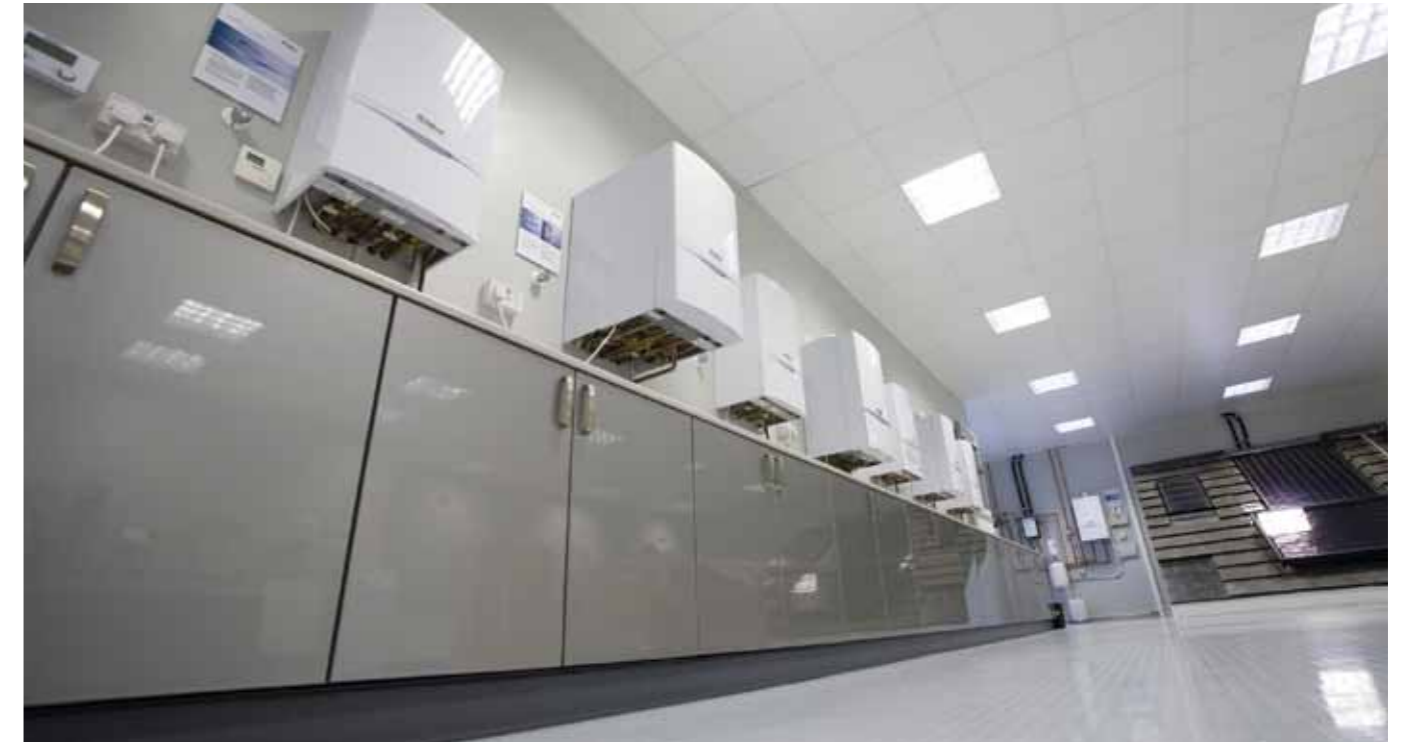
State of the art Vaillant Training Centre in Bristol

We take great pride in our state-of-the-art training facilities.