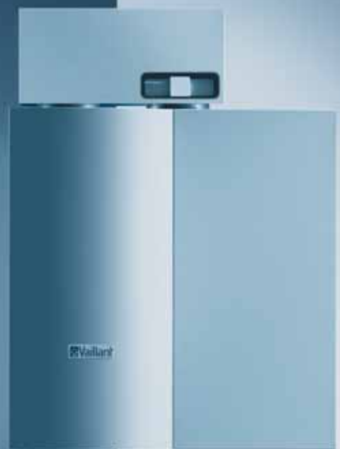
recoVAIR and by-pass unit

Each recoVAIR system comes complete with a Vaillant easy to use multi-function controller. The controller is used to set up the required air volume for the building, set times for normal, low and boost operation, automatically set by-pass control and provides energy saving (gain) information as well as multiple diagnostic and servicing indications.