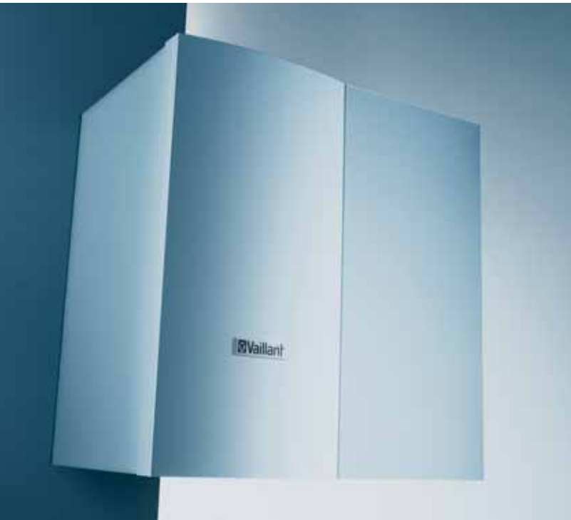
recoVAIR mechanical ventilation and heat recovery system