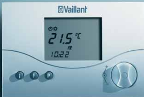
recoVAIR remote control