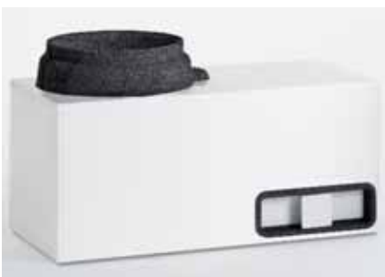
recoVAIR by-pass unit for automatic night time 'free' cooling