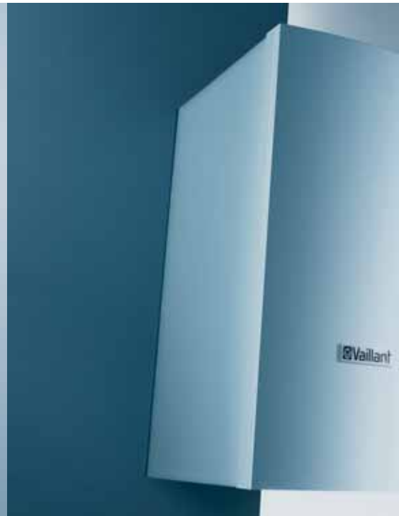
recoVAIR mechanical ventilation and heat recovery system